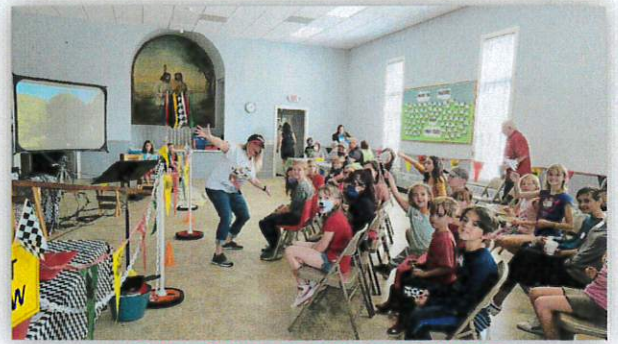
Helping fellow missionaries lead a FasCar Rally in Quinton, DE

We are so thankful for the family we have, and we are so thankful for the ministry that we are able to be a part of...even in the interesting times!