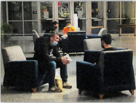
Students being counseled after the Gospel message at REVERB!